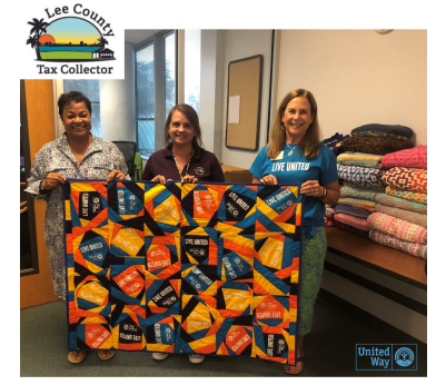
ra Live United bandanas made for a cool blanket!

The Lee County Tax Collector's office staff donated 48 beautiful handmade blankets and 16 disaster blankets to the Early Learning Coalition of Southwest Florida to help preschool providers in our area who sustained damage from Hurricane Ian.